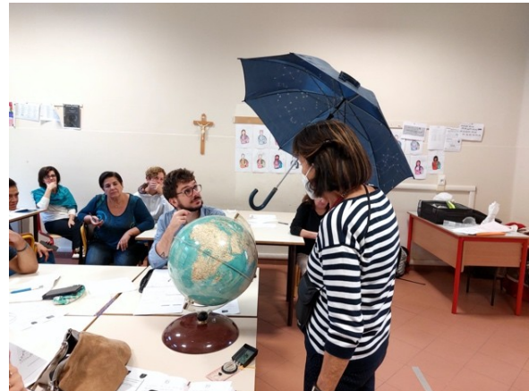
The umbrella is positioned over the globe aligned to its axis

Position the globe on a table at the centre of the classroom, with the North (or South) pole in the right direction with the help of a compass or of a smartphone with a compass app. Ask a student to position the astronomical umbrella over the globe: which direction will the umbrella tip be? ( northwards or southwards, depending on which hemisphere you have used for your model ). What will be the angle between the umbrella shaft and the horizon - and the table, that is the local horizon? ( the shaft should be aligned with the globe axis ). Ask another student to rotate the globe to simulate Earth rotation. Should it be eastwards or westwards? ( eastwards ).