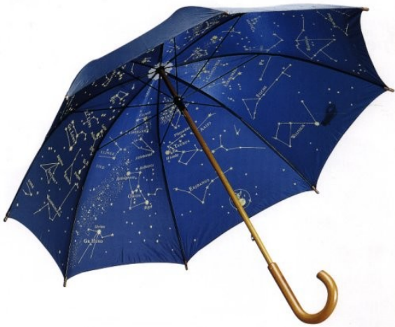
Astronomical umbrella Image: public domain

Many textbooks explain the Earth motions (rotation, revolution, ...) as seen from space. Also, the book pictures provide this kind of perspective, making it difficult for students to understand what they see from another point of view: the Earth's surface where they live. This activity only needs a globe and an umbrella with a sketch of a celestial hemisphere drawn on the internal surface of the canopy. You can buy an astronomical umbrella or a plain umbrella (blue or black) where you – or your students - can draw with a white marker the main constellations of the Northern or Southern hemisphere, according to where you live. To do so, use the pictures on pages 3 and 4: the North (or South) celestial Pole will be at the crossing of the ribs. Tip: use the ribs as a reference to transfer the astronomical grid (meridians and parallels) on the umbrella canopy.