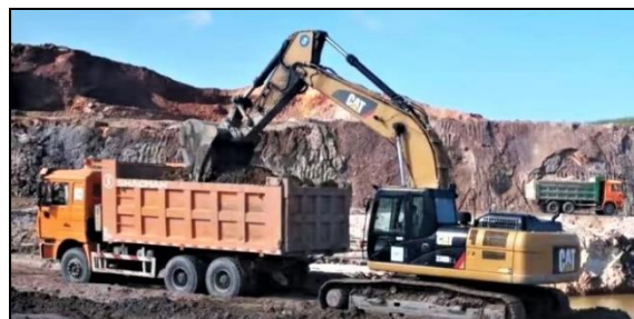
A new graphite mine in Madagascar ( https://source.benchmarkminerals.com/ )

If worldwide production of oil decreases to meet carbon reduction targets, then there will be less synthetic graphite produced and therefore more dependence on mining and recycling. Production in 2022 was already about 5 times higher than in 2018.