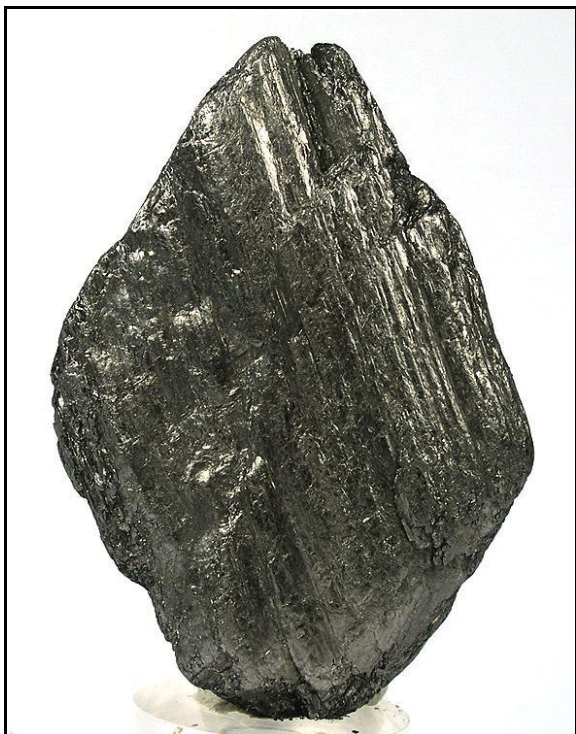
Graphite from a mine in New Hampshire USA

Did you know that you have a sample of graphite in your pocket or in your pencil case? A “lead” pencil contains graphite mixed with clay. (The Greek for “to write” is graphein , from which graphite takes its name). Some electronic equipment and most rechargeable batteries also contain graphite, so it is never very far from you. Graphite is a form of carbon and is one of the softest minerals known, which is why it can be used to make a mark on paper– in contrast to another form of carbon, namely diamond which is the hardest.