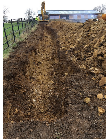
First trench dug In Jurassic limestone. It was then lined with clay to provide a good heat conductor

Around 98% of the heat absorbed from the ground in ground source heat pumps is solar energy (renewable energy from the Sun). Only around 2% is geothermal energy from the Earth.