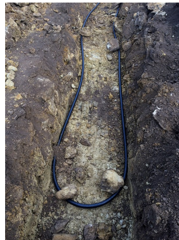
Pipes laid In trench in above installation. 8 trenches were dug in total.