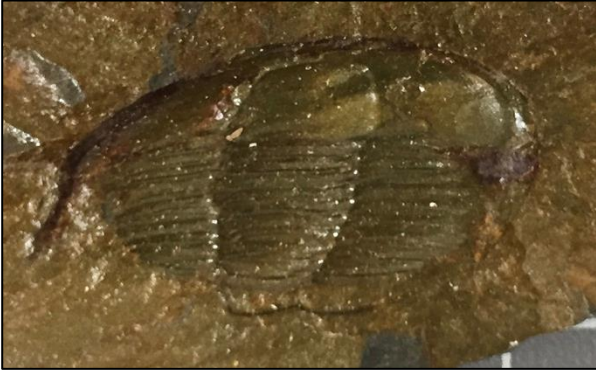
A deformed trilobite

Geologists can work out the stresses that rocks have undergone by looking at the ways in which fossils have changed shape. The deformed trilobites from the Ordovician rocks of North Wales show the effects of stress on the rocks in which they are found.