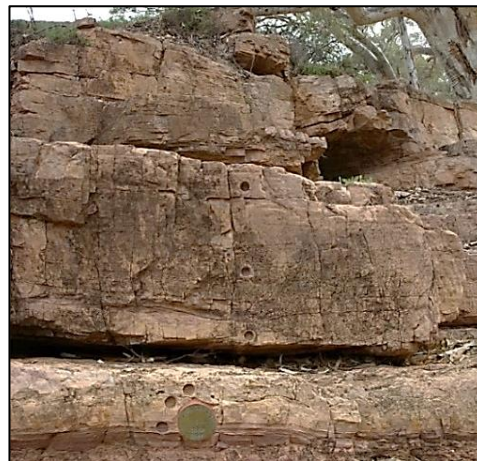
The ‘golden spike’ of the GSSP at the base of the Ediacaran System; the start of the Ediacaran Period.

The two photos below show the golden spike for a GSSP in Australia, at the base of the Ediacaran System. This denotes the start of the Ediacaran Period of geological time recognised worldwide (the Ediacaran Period is at the end of the Precambrian time period).