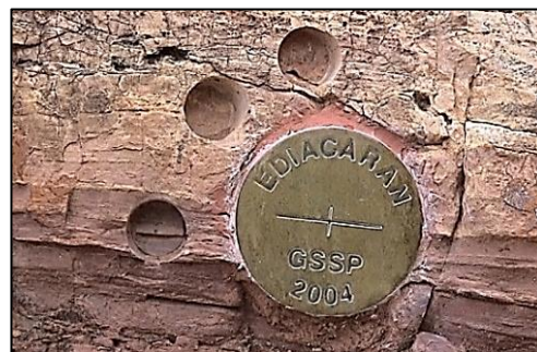
An enlarged photo of the Ediacaran ‘Golden spike’.