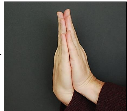
Sedimentary sequence changed to sedimentary rocks; tilted in a mountain-building episode millions of years later.