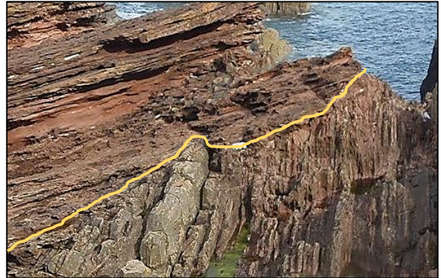
An angular unconformity with the whole sequence tilted down to the left - Siccar Point Berwickshire in eastern Scotland, UK. Near-vertical grey Silurian sandstones below; reddish Devonian sandstones above. ( David Bailey ).