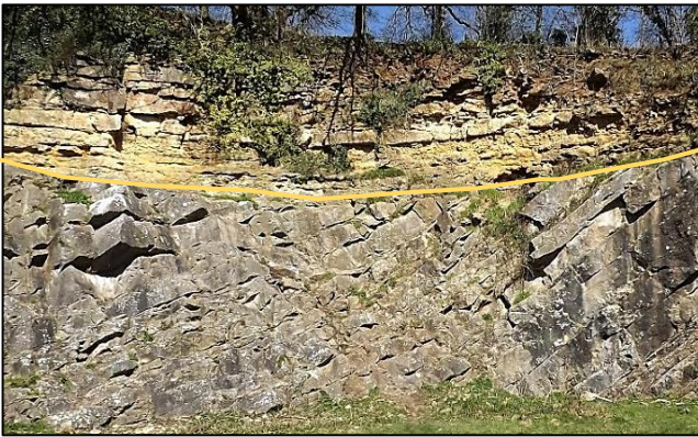
An angular unconformity with near-horizontal upper beds - the Henry De La Beche unconformity, Vallis Vale, Somerset, UK. Grey Carboniferous limestone below; buff-coloured Jurassic limestone above. ( Alan Holiday ).

You can demonstrate the sequence of geological events that produces angular unconformities by using your hands.