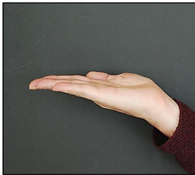
Single bed laid down horizontally.