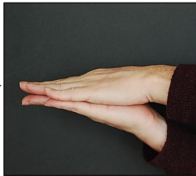
More beds laid down on top to form a horizontal sedimentary sequence.