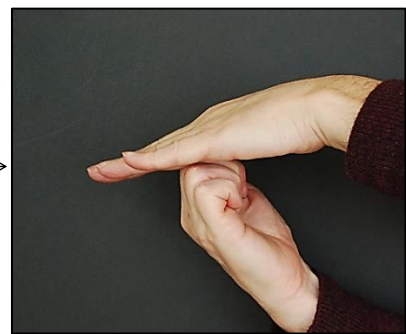
Millions of years later, whole rock sequence tilted in another mountain-building episode (some unconformities have not been tilted).