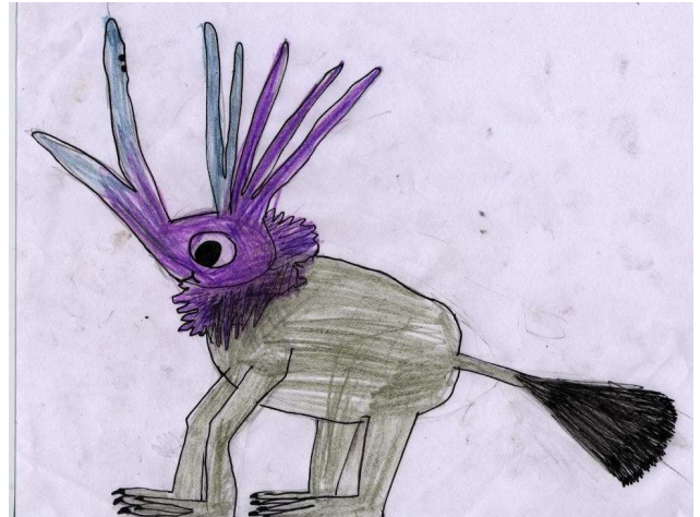
Saurantel, drawing by Nicholas Davidson, aged 8