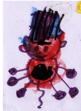
Manspimon, drawing by Tamsin Davidson, aged 5