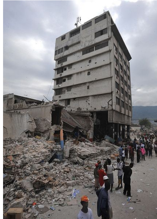
Damaged buildings in the Port-au-Prince neighbourhood of Bel-Air, after the 2010 Haiti earthquake. The tall block remains standing amid the ruins of lower, less well-constructed buildings.

Ask the pupils to suggest what relevance this demonstration has in the real world. Most will suggest that the model is showing what happens to buildings when they are affected by an earthquake. No doubt, pupils will relate their observations to images seen on T.V., filmed during a recent earthquake.