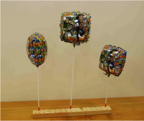
Photo 1: Model 'buildings' of different heights, using helium-filled balloons

Make up a model as shown in either of the two photographs, depending on what materials you have to hand.